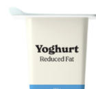
Frozen reduced fat yoghurt tub

For more great tips on keeping the lunchbox cool scan the QR code or visit www.swapit.net.au/safe