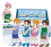
Term 1 2024 Thursday Canteen Roster

Thank you to our volunteers who have signed up on our canteen roster. This term we still have two days free, so if you have a spare few hours on 22 and 29 February we would love you to come and join the canteen community. Please call the office to add your name to the list.